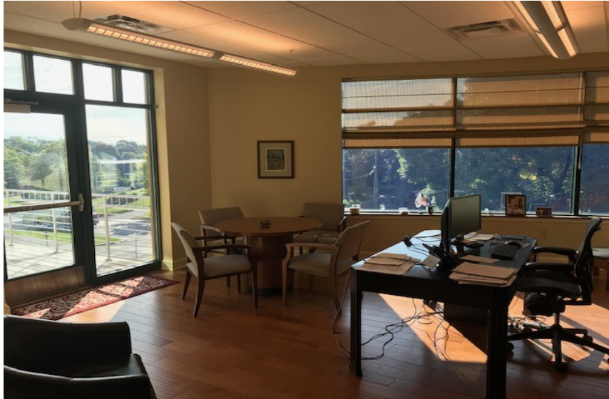
Spacious offices with lots of natural light