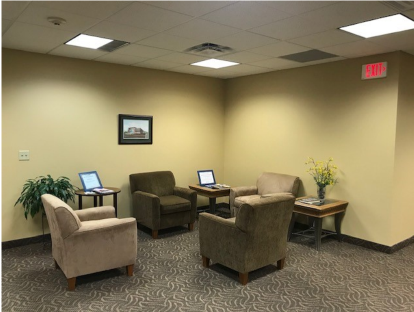
Upgraded reception/waiting area