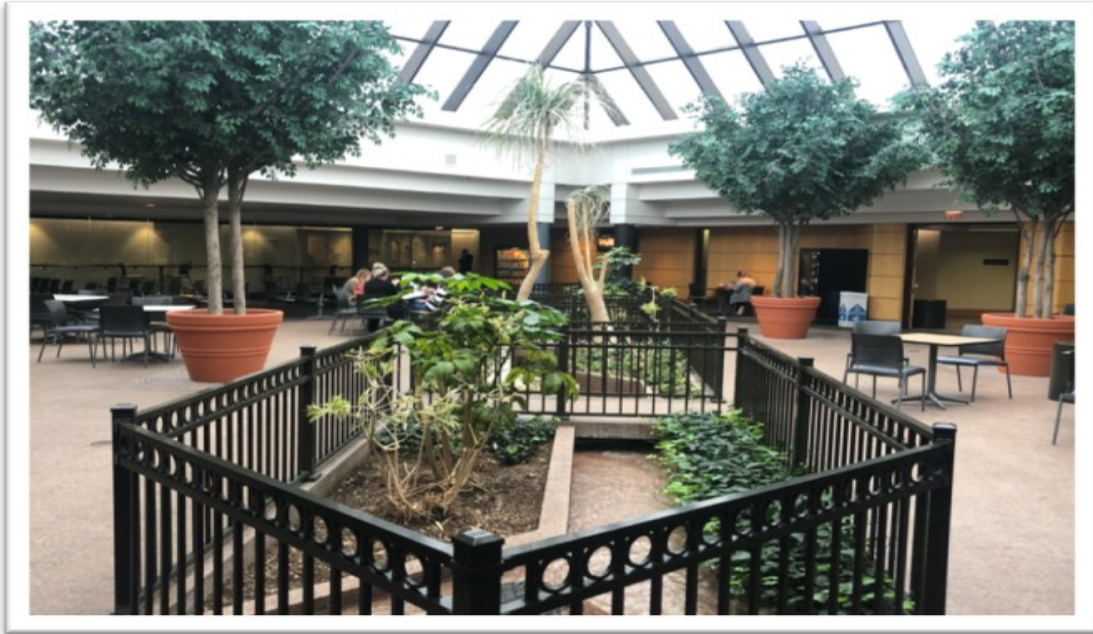
Common Waiting Area